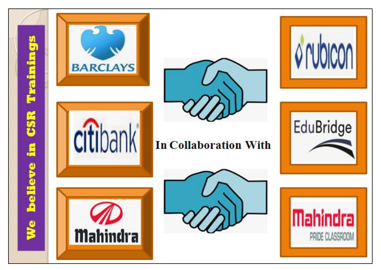
I} Mahindra Pride Classroom -