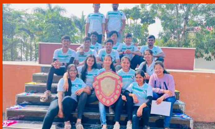
S.Y B.PHARM STUDENTS WITH GENERAL CHAMPIONSHIP FOR ACADEMIC YEAR 2023-24