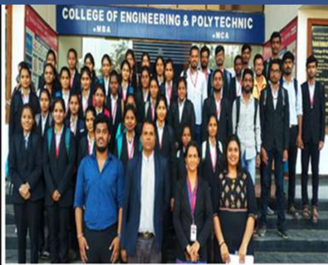
Participants of Aptitude Training Wokshop along with FUEL Trainer, MCA HOD and Central TPO