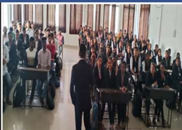
Guidance to CSE & MCA Students from Symbiosis Guests