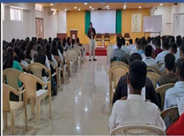
Participants of Guest Lecture along with General Science Staff Members, HOD and Central TPO