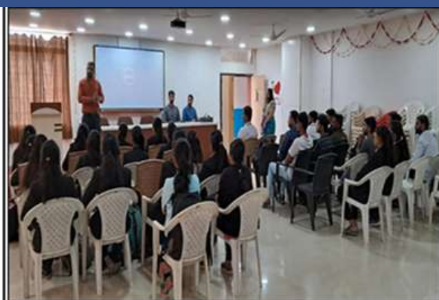
Company Introduction to students from Guest