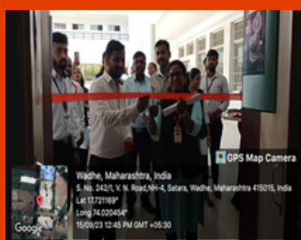
ML LAB INAUGURATION