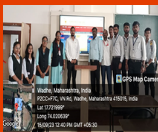
ICT LAB INAUGURATION