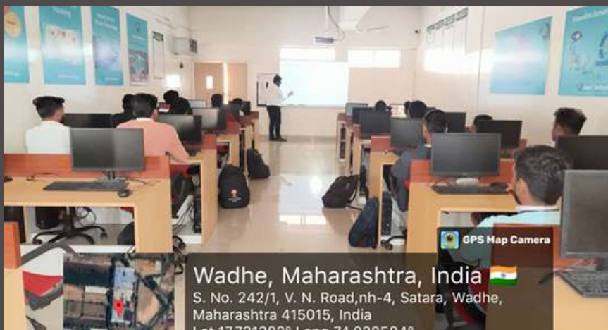
Wadhe, Maharashtra, India S. No. 242/1, V. N. Road, nh-4, Satara, Wadhe, Maharashtra 415015, India Lat 17.721382° Long 74.020584°