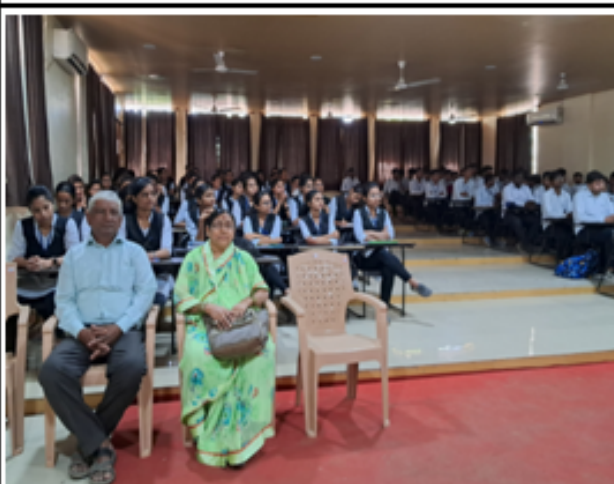
Students (Participants) attending the guest leture from Guest Speaker