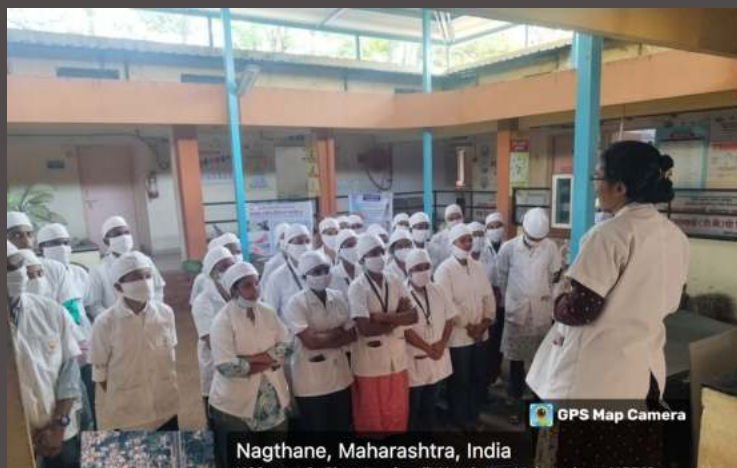
Nagthane, Maharashtra, India